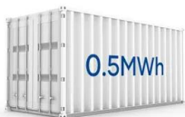
Standard 20ft containers